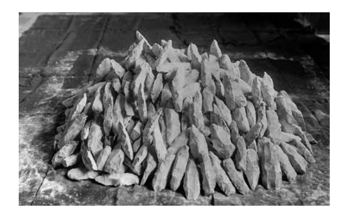
Fig. 5. Neolithic flint picks found during the excavation campaign at Spiennes, financed by Louis Cavens, between 1912 and 1914 (coll. Royal Institute for Cultural Heritage, Brussels, Boo5283, ©RICH)

strée wrote to Cavens as soon as interesting archaeological artefacts and ensembles were presented on the market. Patriotic motives seem to have limited Cavens to purchasing archaeological collections from Belgium and neighbouring countries. On this subject Capart writes to Cavens in 1930: