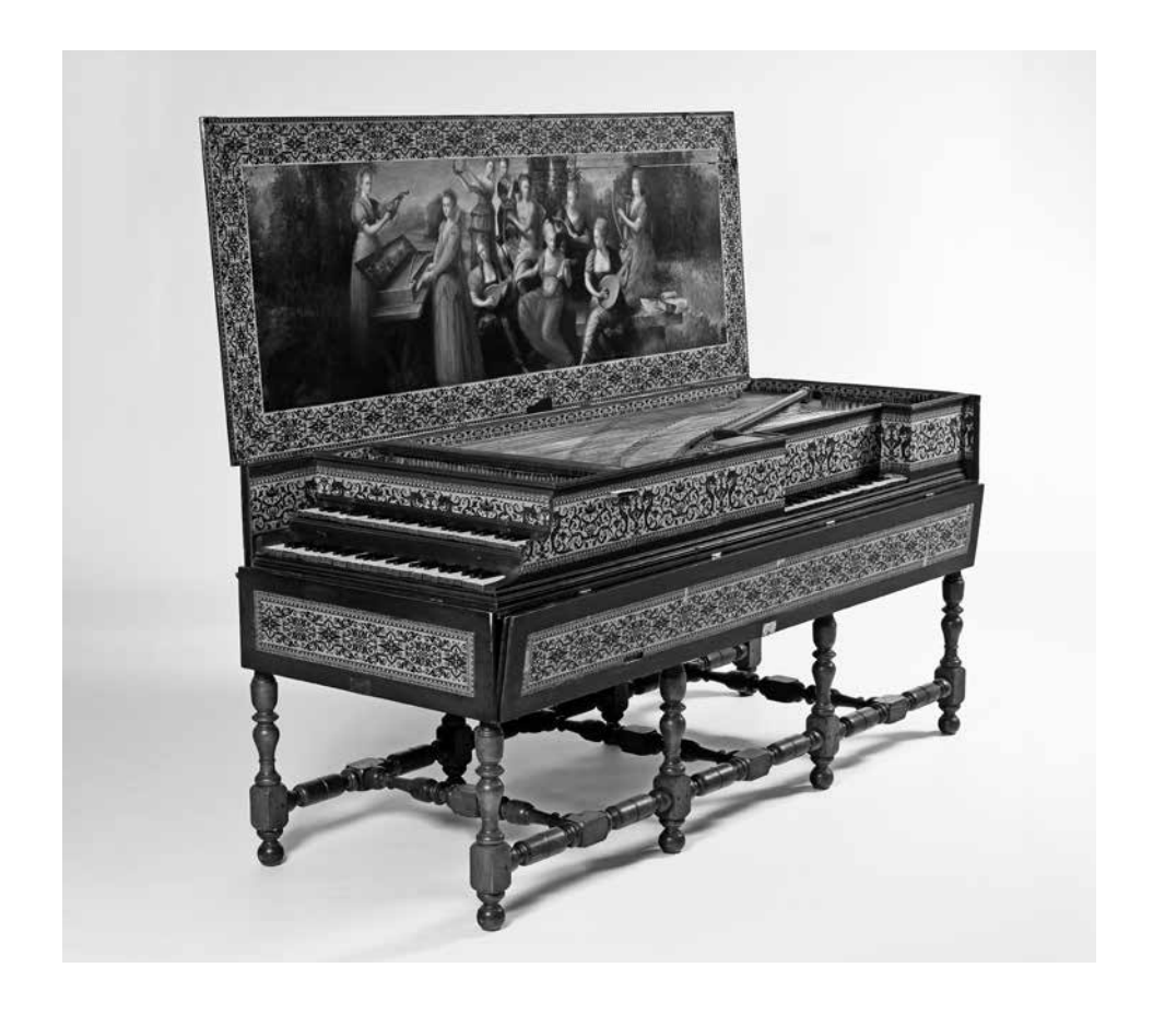
Fig. 3. Double-manual harpsichord combined with a virginal (I. Ruckers, Antwerp, 1619; coll. Musical Instruments Museum, Brussels, 2935, ©RMAH)

Some time ago, you told me about various wooden objects and alabaster heads that you had found during a study trip to provincial antique shops, he wrote to Destrée. The conditions of purchase seemed very advantageous. If you could acquire them, I would gladly offer them to the Museum of Antiquities. On this occasion, I congratulate you for your dedication in bringing objects into the collections of the state museum free of charge and for the initiative you have taken in making scientific and research excursions in Belgium, thus putting you in direct contact with people who possess objects of interest for art and art history. It seems to me that it is part of the mission of a dedicated curator to do what you do. It's not waiting in your office for dealers to come in and offer objects at high prices, of course. The curator has to do the most active research himself.<sup>40</sup>