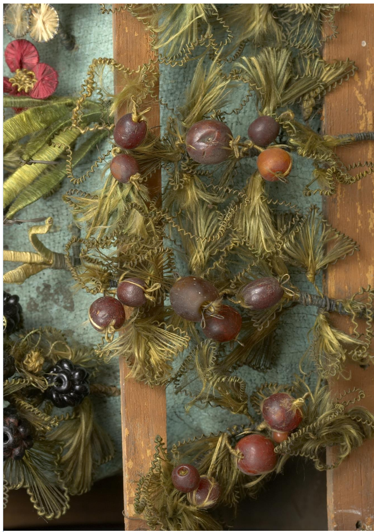
Fig.1: Mixed-Media: Detail of silk flowers in the Enclosed Garden of St. Ursula, (ca. 1530). Materials: silk, silver and messing threads, parchment, glass pearls, coral, peat, wood, textile fabric...

Promoters of the research project are the Royal Institute for Cultural Heritage, KIK-IRPA, the University of Leuven and the University of Antwerp, Axes.