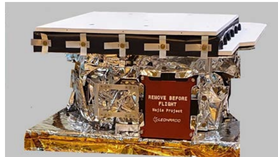
Fig. 1. Optical head of the MAJIS instrument. Dimensions: 912x765x356 mm 3 , 41 kg. The aperture of the optics is protected by a red cover.

wavelengths. Within each channel, a grating spectrometer scatters the photons on the detector, so that the along-slit direction is spatial and the cross-slit direction is spectral.