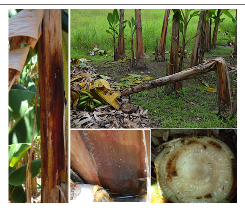
FIGURE 6 | Erwinia-associated diseases (bacterial head rot or tip-over disease caused by Erwinia carotovora ssp. Carotovora and E. chrysanthemi, bacterial rhizome and pseudostem wet rot (Dickeya paradisiaca formerly E. chrysanthemi pv. paradisiaca)). The photos depict pseudostem symptoms and pseudostem doubling.