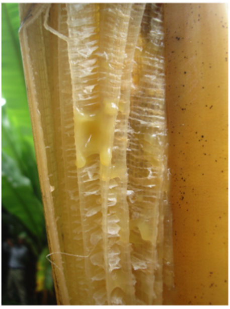
FIGURE 3 | Xanthomonas bacterial wilt of enset caused by X. campestris pv. musacearum . The photos depict leaf yellowing and wilting, and pockets of bacterial ooze in a leaf petiole.

by bacterial wilts reduces water flow is not completely clear. There is no evidence for excessive transpiration linked to loss of stomatal control as could possibly result from a systemic toxin (Buddenhagen and Kelman, 1964; Van Alfen, 1989). The primary factor is most likely plugging of pit membranes in the petioles and leaves by a high molecular mass extracellular polysaccharide (Van Alfen, 1989), but high bacterial cell densities, plant-produced tyloses and gums, and byproducts of plant cell wall degradation may be contributing factors (Denny, 2006).