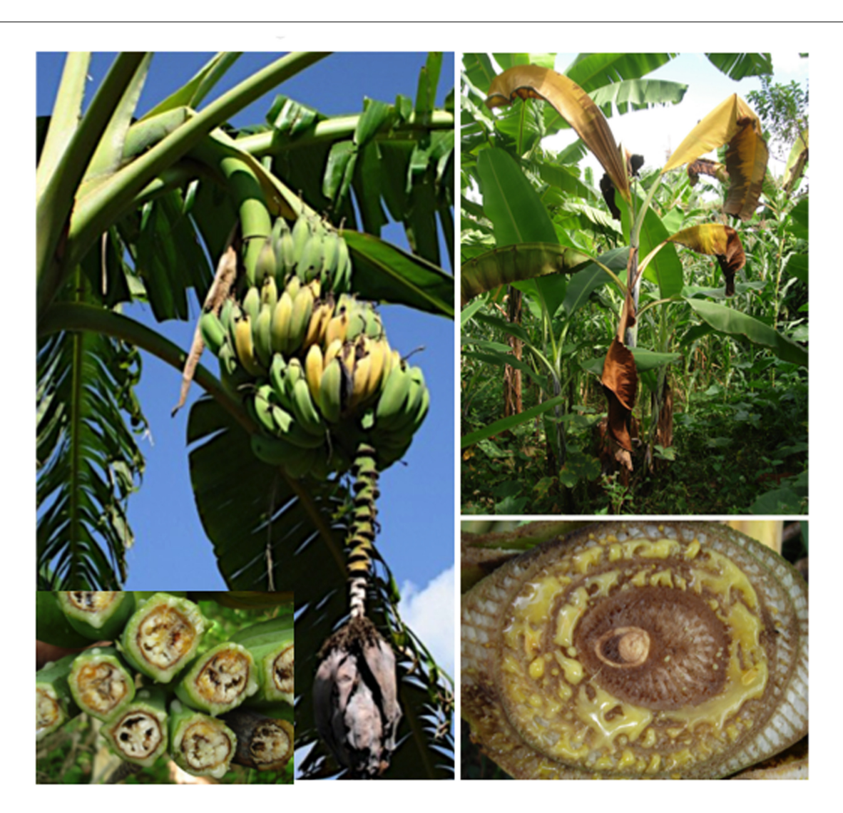
FIGURE 2 | Xanthomonas bacterial wilt of banana caused by X. campestris pv. musacearum . The photos depict leaf yellowing and wilting, exudation of bacterial ooze, premature fruit ripening and fruit discoloration.

strains of the disease were already present on solanaceous and other crops, including Musa textilis in 1969 (Zehr, 1970; Eden-Green, 1994a; Seal and Elphinstone, 1994; Taghavi et al., 1996). A first report of R. solanacearum causing Moko disease of banana in Malaysia was published by Zulperi and Sijam (2014). Reports of the occurence of banana bacterial wilt in Cambodia and India have not been confirmed (Jones, 2000; Daniells, 2011). An outbreak of R. solanacearum on ornamental Heliconia spp. in Australia was eradicated (Jones, 2000).