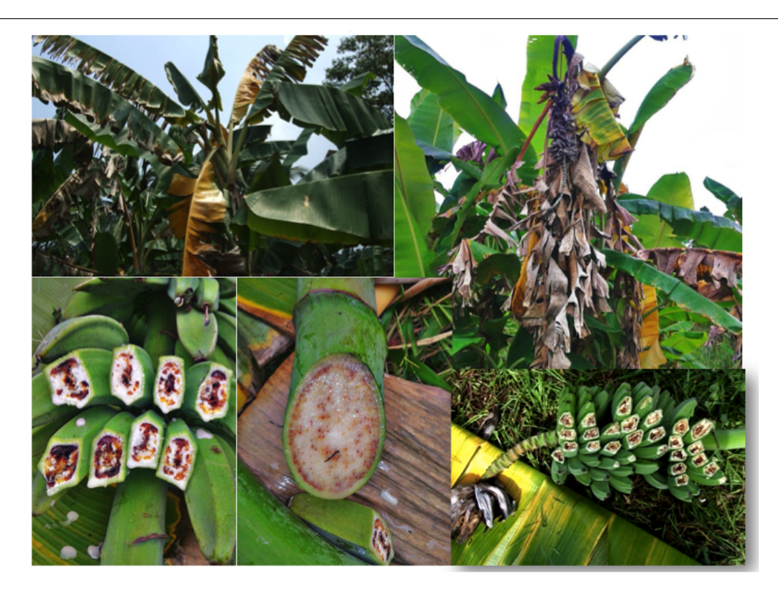
FIGURE 5 | Banana blood disease caused by R. syzygii subsp. celebensis. The photos depict leaf yellowing and wilting, and fruit pulp and bunch stalk/rachis discoloration. Photos were taken in Malaysia by Agustin Molina.

entire plant, and suckers will also wilt and die (Eden-Green and Seal, 1993; Eden-Green, 1994b; Supriadi, 2005). R. syzygii subsp. celebesensis strains causing banana blood disease is strictly related to banana (and some Heliconia ) and not to Solanaceaous hosts, unlike R. solanacearum strains causing Moko/Bugtok disease.