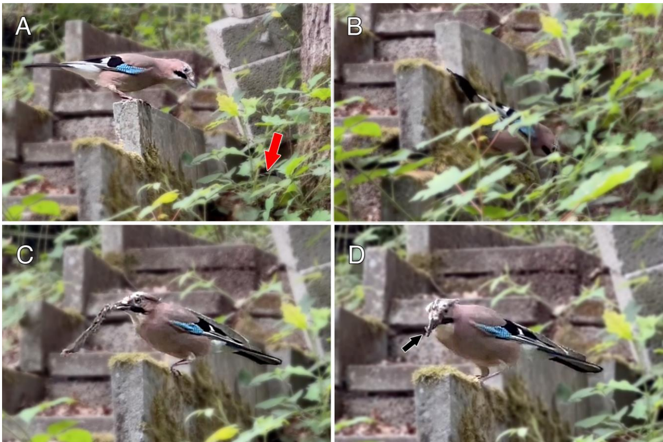
Figure 3: Screenshots of the Online Appendix video showing an Eurasian jay catching a Purseweb spider (black arrow), the 4 th of June 2022 in Bousval (Brabant-Wallonigs, Belgium). A. Jay's target in sight, Atypus retreat being somewhere between the tree base and the garden stair's border (red arrow). B. Digging up the sock-shaped tube of the A. affinis individual. C. Entire sock-shaped tube unearthed. D. The silk tube unstitched and the spider collected (black arrow).

MÄCK 2006). However, no detailed information on the identity of the preys of these "spider-eating Jays" could be found. Similarly, the difficulty in finding precise identities of predators in the literature also applies to A. affinis . Although Purseweb spiders are redoubtable predators, they are also sometimes cited as being the prey of other arthropods and small vertebrates, including mammals or birds (NEWTON 2008, BANDAR 2012).