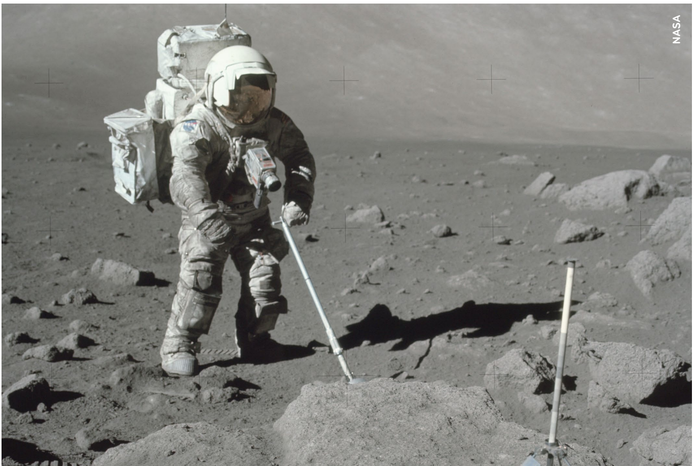
Apollo 17 astronaut, Harrison Schmitt, collecting a soil sample. His spacesuit is coated with dust.

As space agencies like NASA and ESA are preparing to return to the Moon, international teams of scientists and engineers are thoroughly investigating the physical properties of near-surface lunar dust to assess dust pollution risks and to find ways of efficiently mitigating its dangers. Among them is the DUSTER project team, led by the Royal Belgian Institute for Space Aeronomy (BIRA-IASB), which combines efforts with ONERA, the French Aerospace Lab, Instituto de Astrofísica de Andalucía