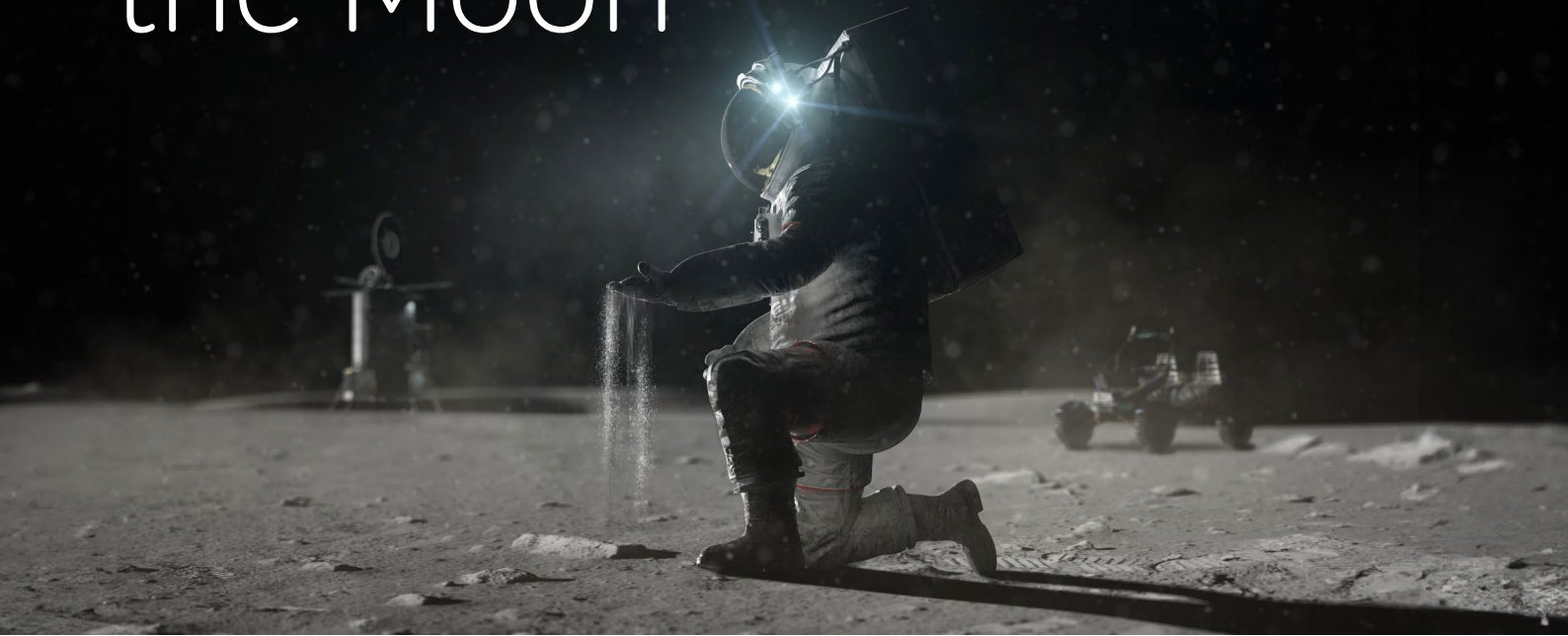
An artist's rendering of an astronaut working on the lunar surface during a future Artemis mission.