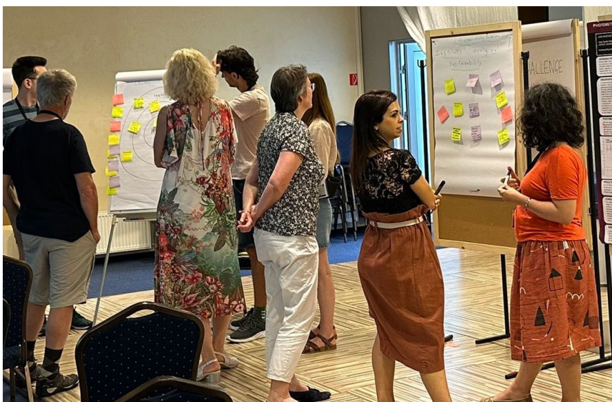
Europlanet’s community consultations on future activities and sustainability have included an ideas wall at EPSC2022 (left) and roadmapping sessions at the Europlanet Research Infrastructure Meeting (ERIM) 2023 (above).

To find out more about the benefits and pricing for institutional membership, see: www.europlanet-society.org/beyond2024 .