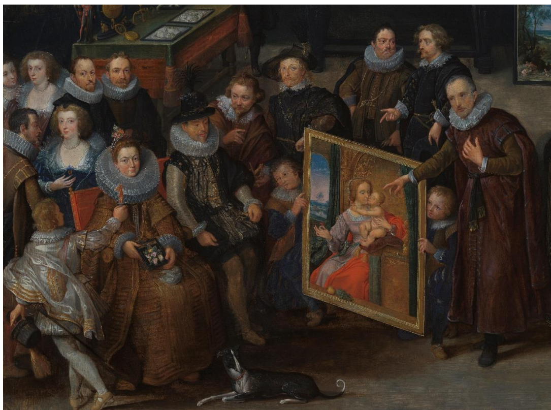
Willem van Haecht, The Gallery of Cornelis van der Geest (detail), 1628, Antwerp, Rubenshuis