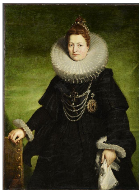
Workshop of Peter Paul Rubens, Portrait of Archduchess Isabella, Private collection

This conference will address for the first time Isabel's artistic and cultural agency, by analysing works of art and architecture commissioned, promoted and collected by her in different media during her youth in Madrid and her married life and widowhood in Brussels.