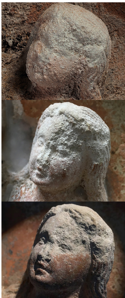
Figure 8. Detail of the memorial: before treatment (left); after treatment (right)

a drilled hole (3 cm long RH and T-probe) was measured throughout the drying process.