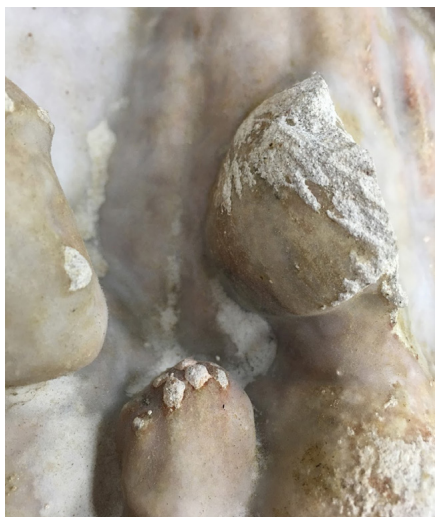
Figure 7. White crust formed on the surface immediately after the sublimation of the CDD

Cyclododecane as protection for water-sensitive polychromy during water bath desalination of limestone sculptures: The case study of a mid-15th-century wall-mounted memorial from the Burgundian Netherlands