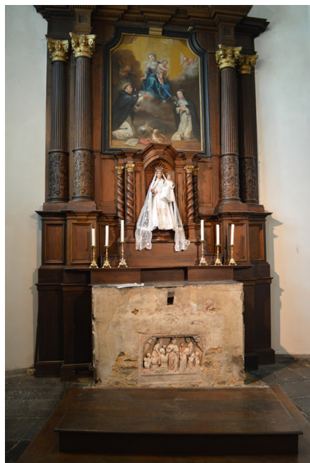
Figure 1. Memorial enshrined in the masonry of the altar dedicated to our Lady of the Rosary

Cyclododecane as protection for water-sensitive polychromy during water bath desalination of limestone sculptures: The case study of a mid-15th-century wall-mounted memorial from the Burgundian Netherlands