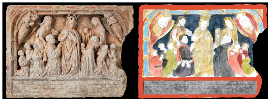
Figure 2. Left: memorial after treatment, Merbes-le-Château (1443); right: reconstruction of the polychromy

The tablet is carved in stone from Avesnes-le-Sec (Avenderstone), a white limestone with tiny black or greenish spots – glauconite – often grouped in clouds. The northern French limestone permitted the figures to be carved almost in the round. As usually seen on similar sculptures from this period, the stone relief was entirely painted (Brine 2015). Because most of the final polychrome finish had been lost, the ground layer was mainly visible. The literature discussing the polychromy on wall-mounted memorials from the 15th century in the Low Countries (Nys 2001, Serck-Dewaide 2018) states that underlayers were generally made with earth (iron oxide-based) pigments and with little binder. Nevertheless, a thorough microscopic examination made it possible to reconstruct most of the colour palette (Figure 2).