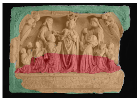
Figure 3. The surface can be divided into three zones: the most weathered zone (red zone), where the salt damage was resulting in the loss of sculpted parts; a mid-weathered zone, with slightly flaky and powdery areas; and a less weathered zone with visible efflorescence