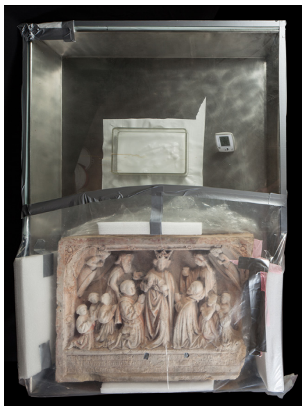
Figure 4. Memorial conditioned in a closed box with a saturated solution of sodium chloride

Cyclododecane as protection for water-sensitive polychromy during water bath desalination of limestone sculptures: The case study of a mid-15th-century wall-mounted memorial from the Burgundian Netherlands