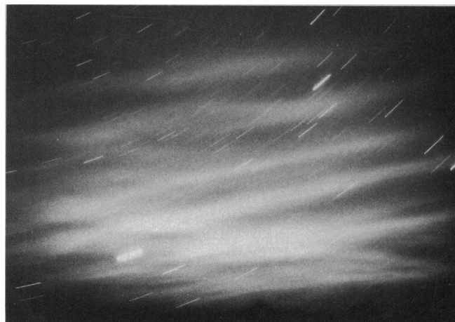
Fig. 1. Photograph taken in the French Alps. Emulsion, high-speed infrared; lens focal length = 55\text{ mm} , f/1.2 ; exposure time, 10 minutes.