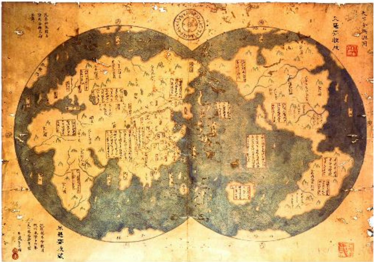
Figure 1: Integrated map of Zheng He of 1418 showing the West Coast of Africa and possible representations of the coasts of America and an austral continent, the representation of Europe suggests contacts with European and Arab geographers. Chinese maps were probably known to the Venetian geographer Fra Mauro who inspired Columbus and his brother the cartographer Bartolomeo Colon.

expeditions are constantly evolving as Chinese historians are progressing very fast in understanding this part of the Chinese past.