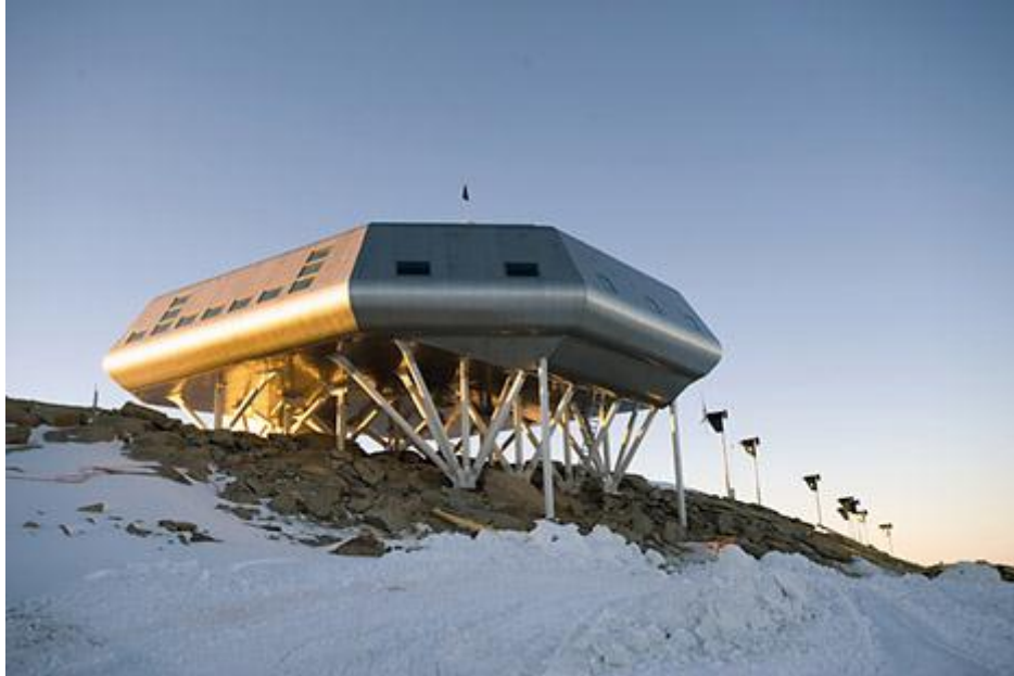
Figure 4: the “Princess Elisabeth” station in Antarctica, this station operates on renewable resources and is unmanned during the polar night, making it a perfect candidate for the testing of remote operations and monitoring.