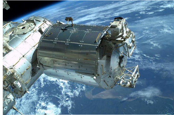
Figure 1: The European Columbus module on the ISS with the SOLAR payload in view of the external platforms of Columbus.

to be used for two main goals: the study of the Sun itself and using the Sun's energetic output as a valuable input for climate models. The combination of these objectives makes SOLAR one of the few experiments studying both Earth and space, and serves several fields of research, such as solar physics, atmospheric physics, and climatology [1, 2].