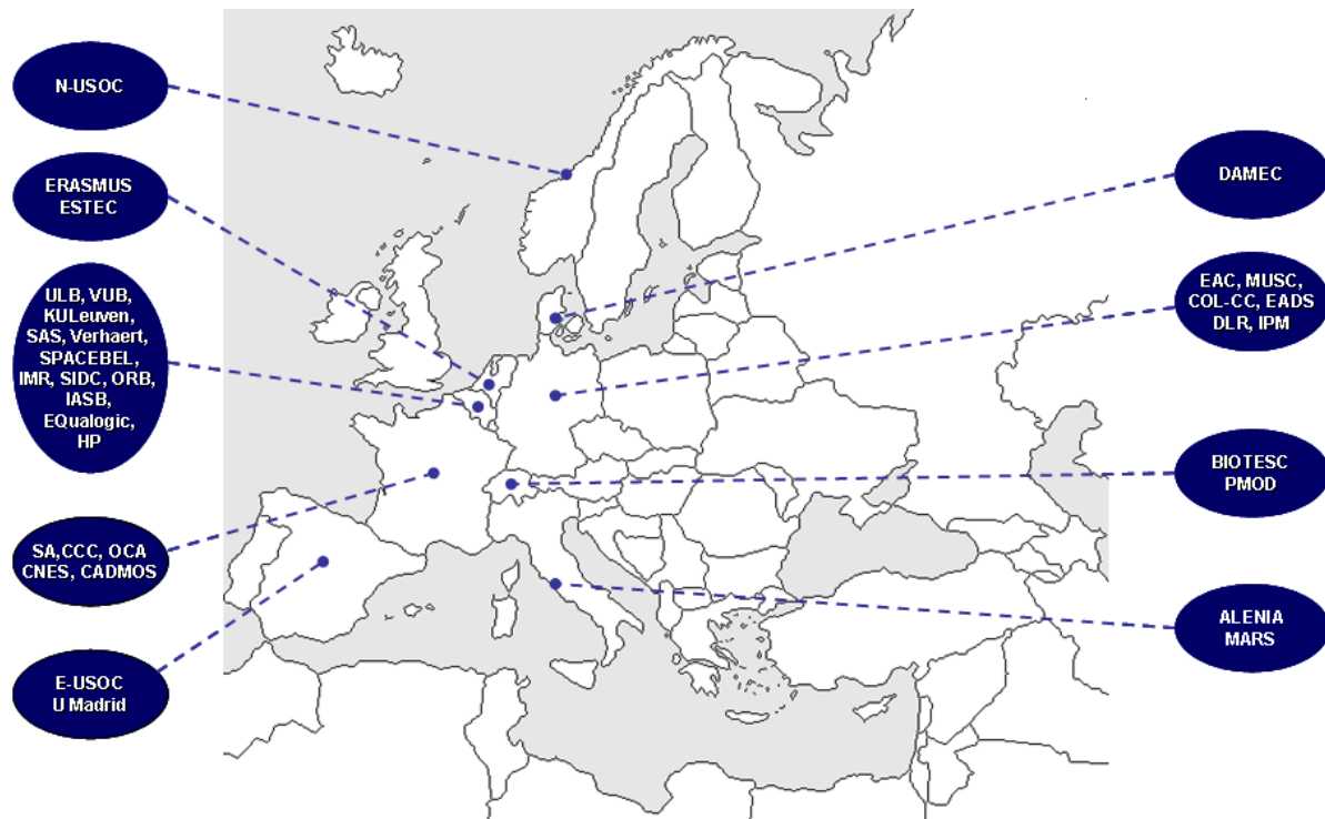
Figure.1: the current partners of B.USOC, N-USOC, ERASMUS, CADMOS, E-USOC, DAMEC, MUSC, BIOTESC and MARS are USOC's, COL-CC is the COLUMBUS control centre and the others are academic and industrial partners. Unsurprisingly, most of the B.USOC partners of this second category are situated in Belgium. The ESA IGS connects only ESA facilities and the USOC's. Most of the European USOC's are ULISSE partners.

In the USOC organisation, the ESA management (Human Space flight, Microgravity and Exploration (HME)) assigns Facility Responsible Centres (FRC) and Facility Support Centres (FSC), B.USOC is FRC for the SOLAR package of COLUMBUS, a set of three instruments monitoring the solar output from the far-UV to the infrared. B.USOC is FSC for the PCDF (protein crystallisation diagnostics facility), a payload inside the European Drawer Rack inside COLUMBUS. In both cases, the B.USOC experience antedates COLUMBUS as space solar instrument are operated by teams of all three institutes present in Uccle since 1983 (Belgian Institute for Space Aeronomy, Royal Meteorological Institute and Royal Observatory). Similarly, B.USOC operates protein crystallisation experiments since 2002. In the future, B.USOC will operate also for CNES the solar science monitoring satellite PICARD to be launched in 2010.