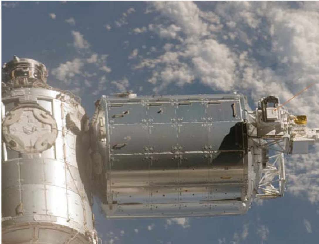
Figure 2: COLUMBUS in flight, SOLAR is indicated by the arrow (NASA document).